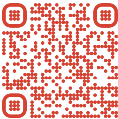
Scan the QR Code to learn more about PRIDE as well as events happening this summer.

CUPW has long participated and supported pride events across the country, and we encourage members to take part in events in their communities and beyond (link to list of Pride events: https://bit.ly/3IMTx7W ). As you enjoy your Pride celebrations with your co-workers, neighbours, family, and friends, remember that hate flourishes in a vacuum of silence and that we must speak up and speak out against hate and discrimination.